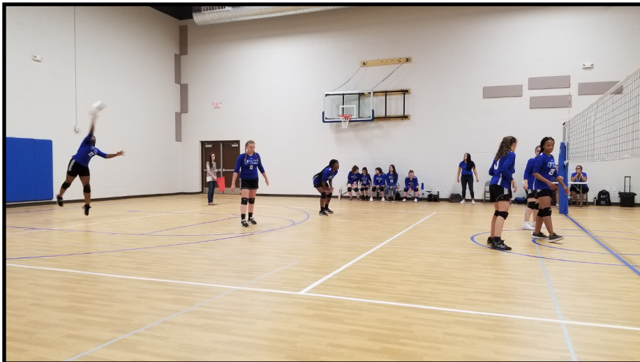
First volleyball match in the HAC: 8/30/19

Thank you donors. You are a blessing. All praise and glory to God.